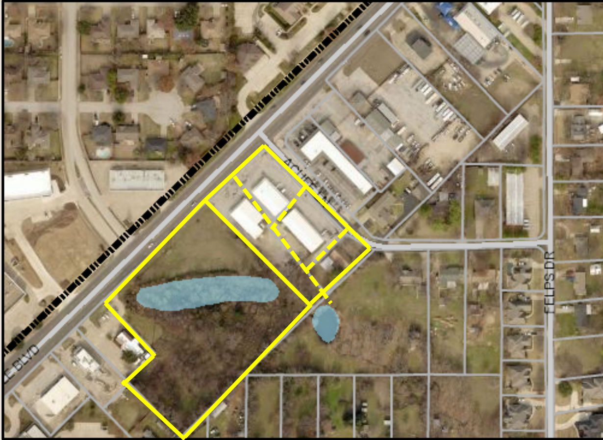
Acuff Properties: 5.9 acres