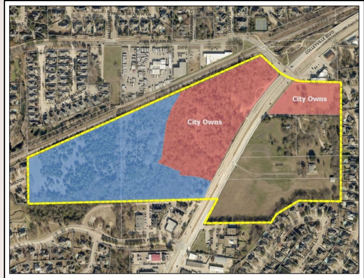
Northern Gateway Properties: 41.2 acres